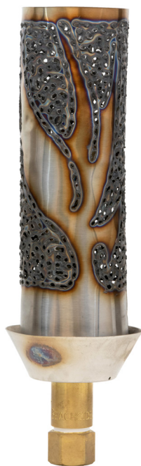
TK-N-BOP (Natural gas) TK-P-BOP (Propane gas)