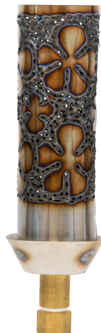
TK-N-PUA (Natural gas) TK-P-PUA (Propane gas)