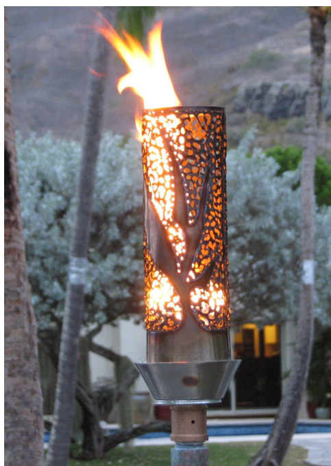
BOP "Bird of Paradise"